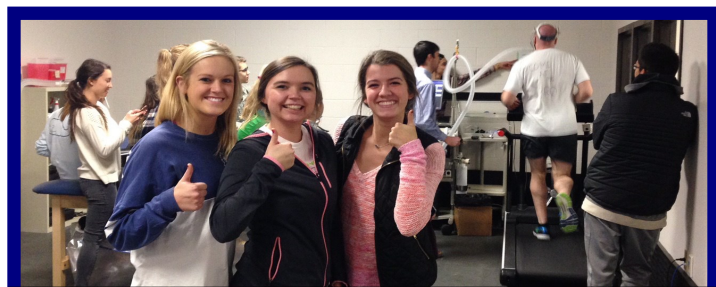
Students enjoying research in the Human Performance Research Laboratory